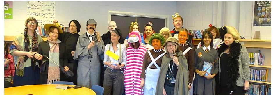
Staff dressed up to celebrate World Book Day