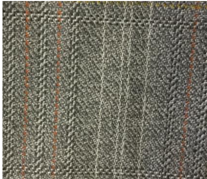
Checked patterned merino 'Cool Wool', with highlight of red, yellows, blues and greens.