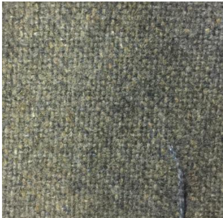
Plain weave, merino 'Cool Wool' with a blue warp and weft.